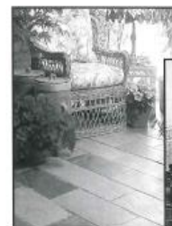
SLATE - Huge range plus quality Italian slate & terracotta.

BARBEQUE BAZAAR DIRECT LIGHTING OUR PLACE CERAMIC TILE & SLATE