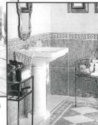
CERAMIC TILES Huge selection - Best Prices

LARGE SELECTION OF LIGHTING & HERITAGE BRASSWARE