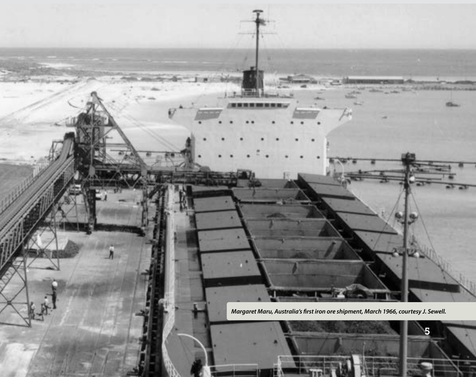
Margaret Maru, Australia's first iron ore shipment, March 1966

2 City of Greater Geraldton, Local Heritage https://library.cgg.wa.gov.au/heritage/local-heritage-links.aspx