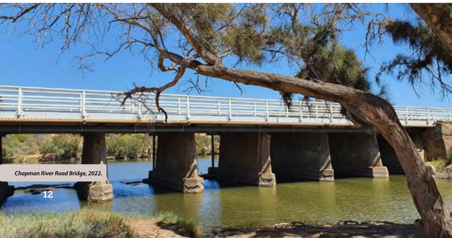
Chapman River Road Bridge, 2022.

Continue to manage the Local History Collection based at the Geraldton Regional Library as a peak depository for local history materials, including written, audio and visual materials, civic and community archives guided by the CGG Operational Policy (OP019) Local History Collection Development Policy.