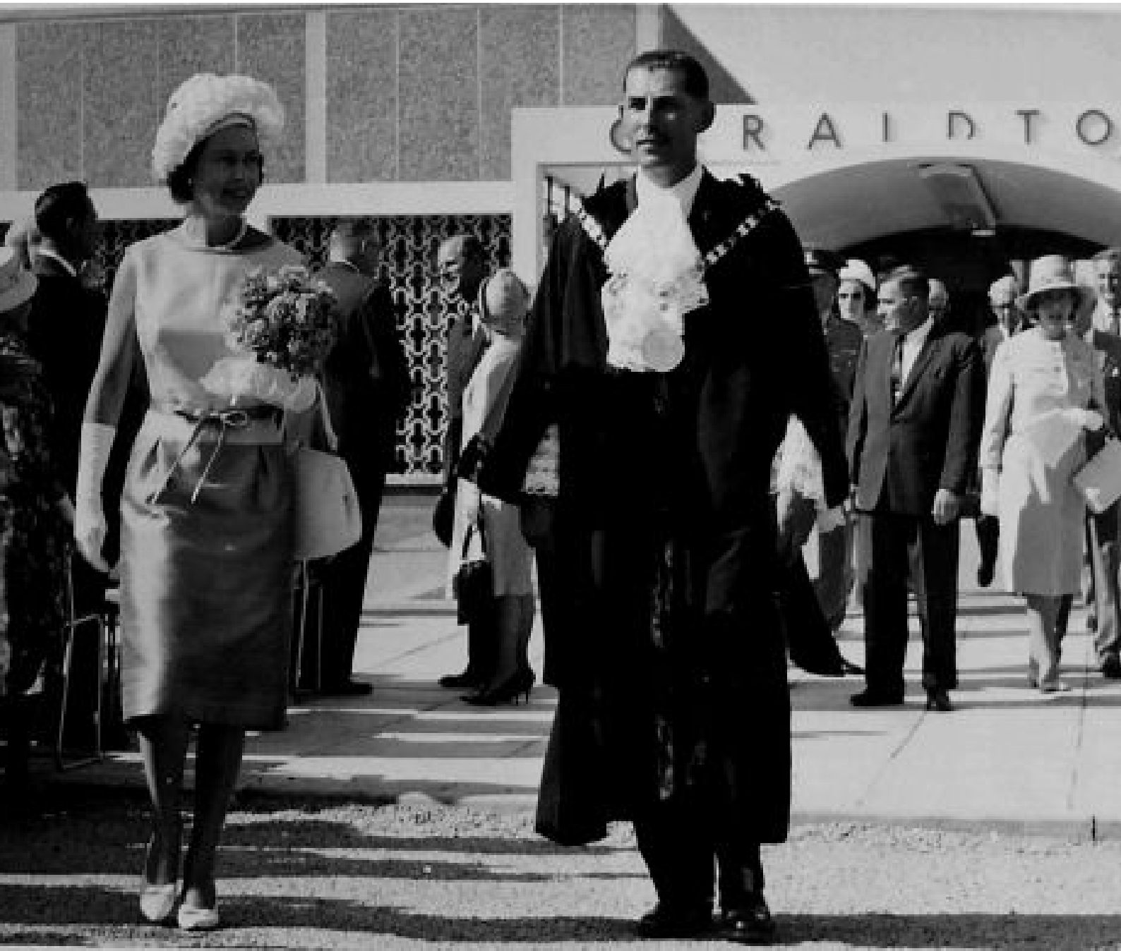
Queen Elizabeth II accompanied by Mayor C.S. Eadon-Clarke at the opening of the Civic Centre, 24 March 1963.