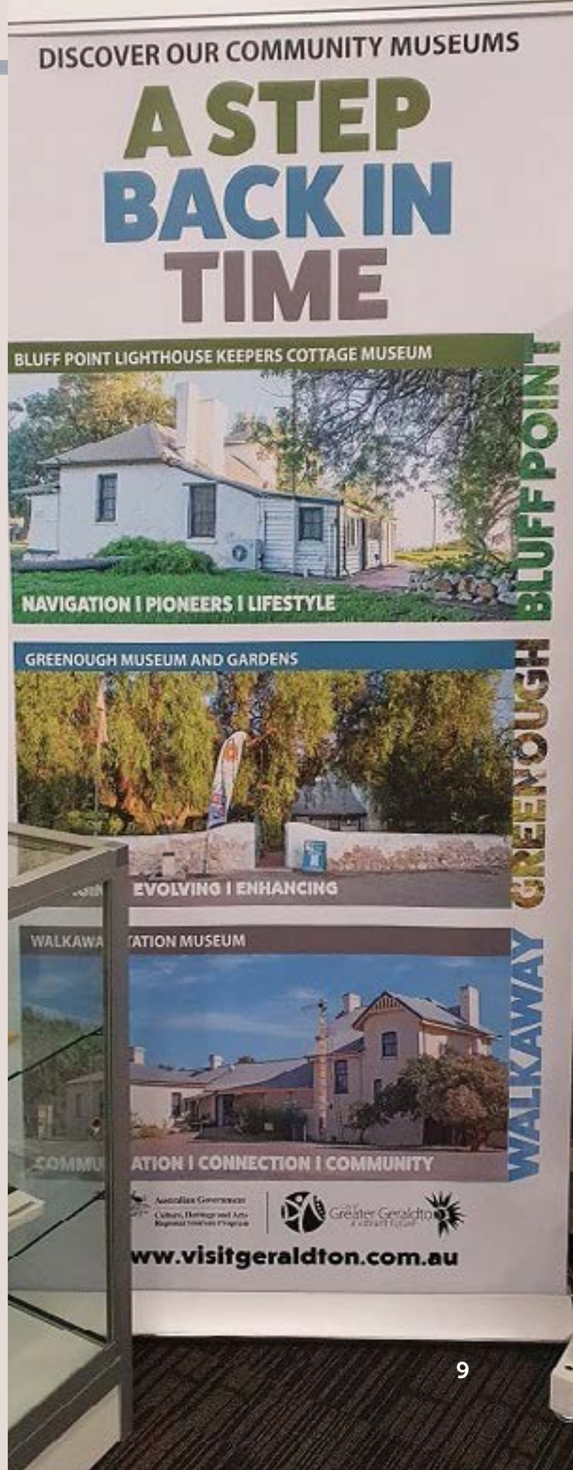
Right: Community Museums promotional banner, 2022.