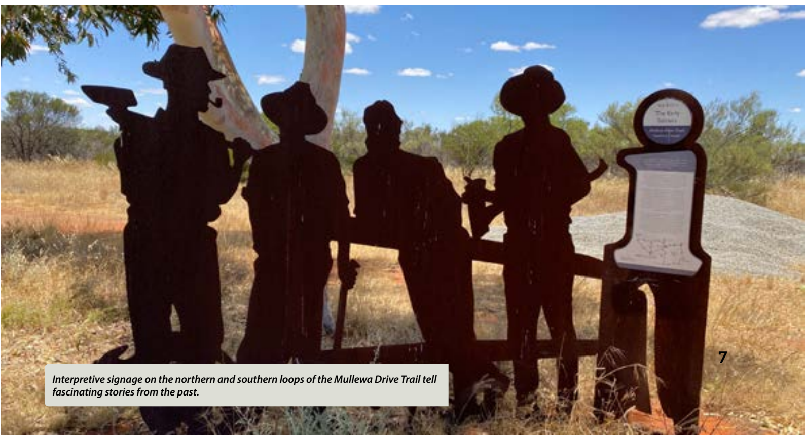
Interpretive signage on the northern and southern loops of the Mullewa Drive Trail tell fascinating stories from the past.

5 City of Greater Geraldton, Strategic Community Plan 2031, p12