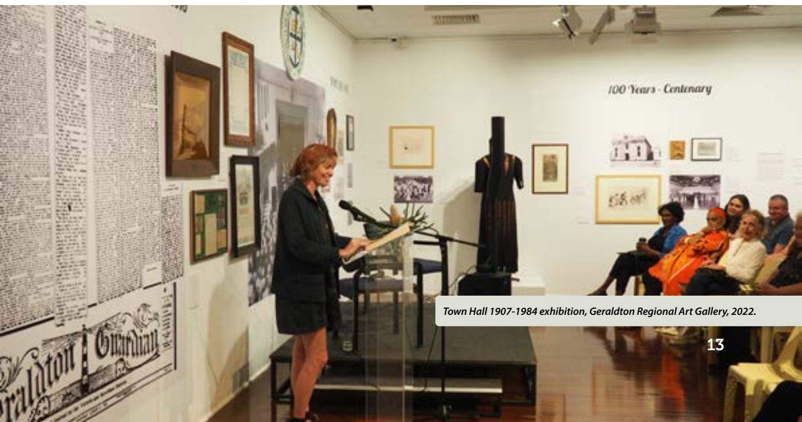
Town Hall 1907-1984 exhibition, Geraldton Regional Art Gallery, 2022.

Encourage stronger partnerships with external stakeholders with regard to the management of heritage sites and the promotion and celebration of our heritage stories.