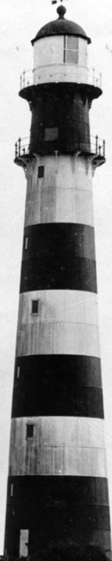
Point Moore Lighthouse

The actions contained herein have been developed to ensure they are achievable , prioritised and result in real outcomes for the community .