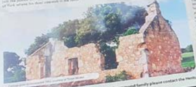
Seaview Cottage, built in 1822, is one of the few remaining buildings of the early settlement.