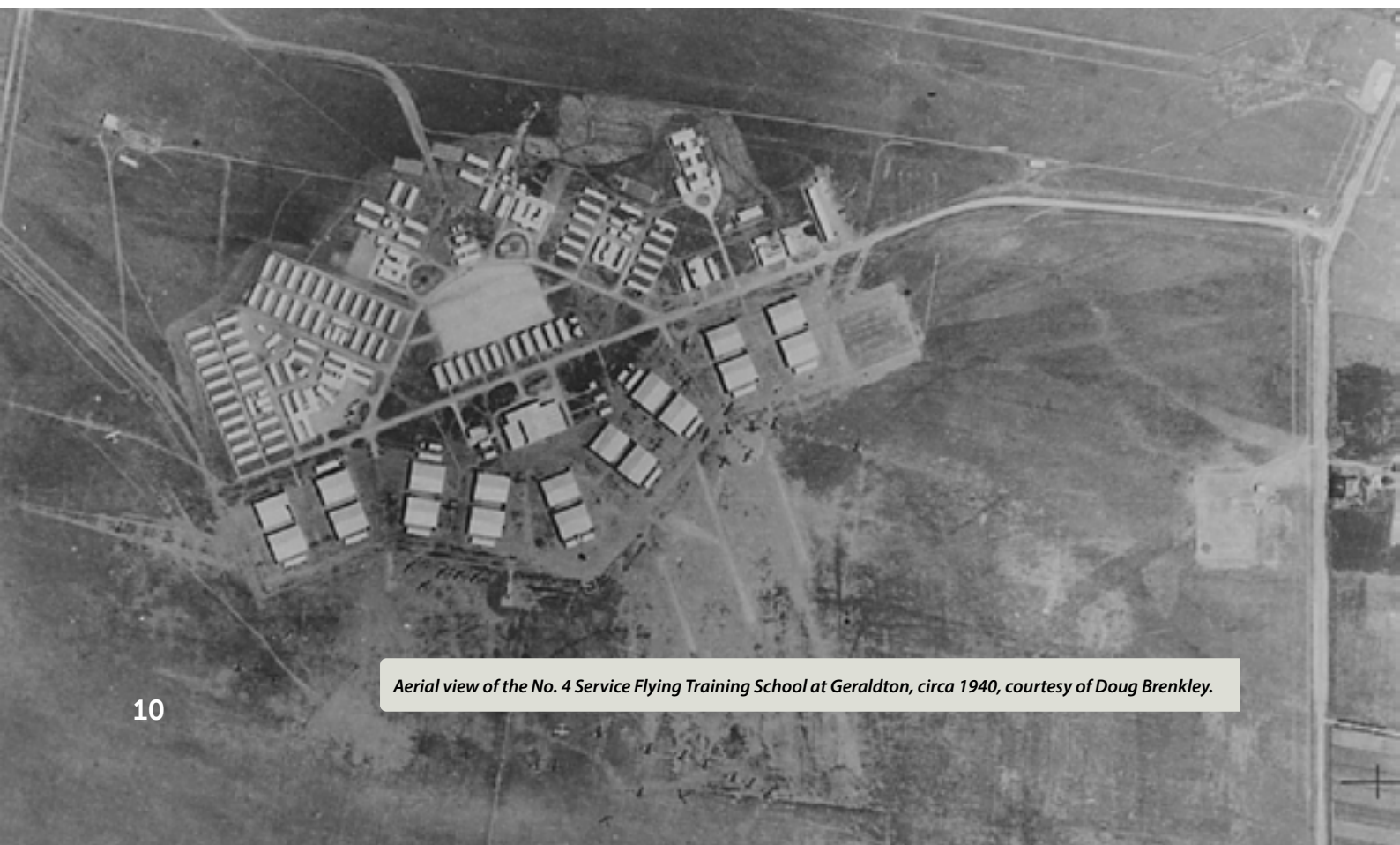
Aerial view of the No. 4 Service Flying Training School at Geraldton, circa 1940, courtesy of Doug Brenkley.