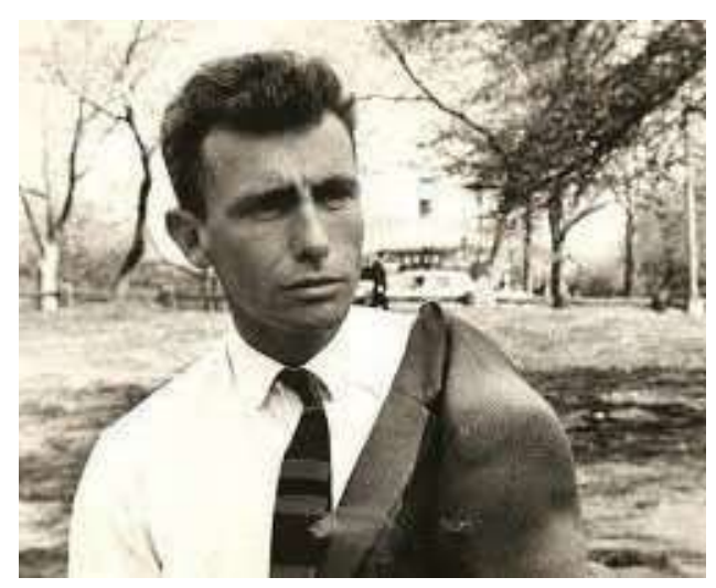
The Randolph Stow Young Writers Award aims to encourage young writers in the Midwest region.

The award recognises the international achievements of Geraldton-born writer, Randolph Stow (1935 - 2010).